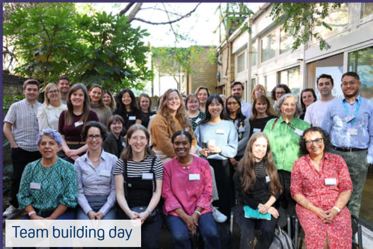
Team building day

At the Medical Research Foundation , we're more than just a team. We're a purpose-driven organisation working to improve lives through ground-breaking medical research.