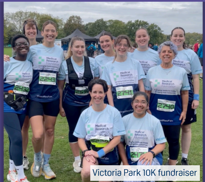
Victoria Park 10K fundraiser