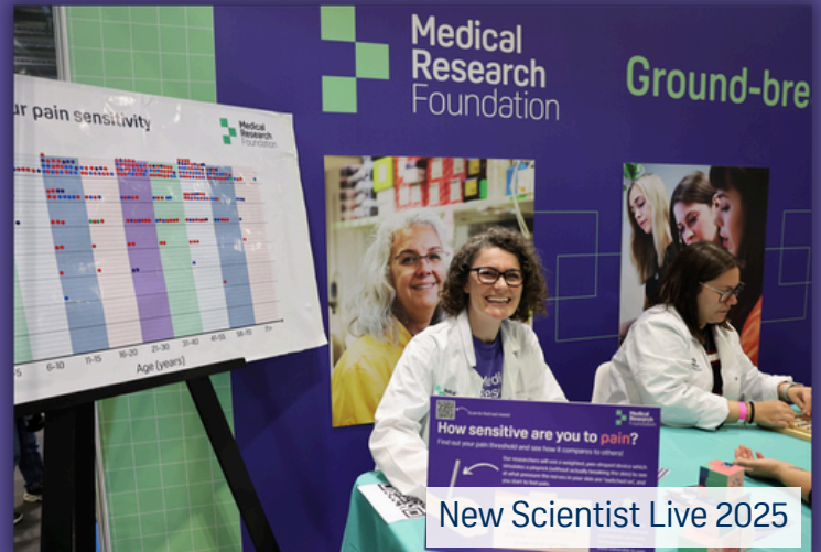
New Scientist Live 2025

By joining us, you can become part of something bigger: a mission to tackle the most pressing and overlooked health challenges of our time.