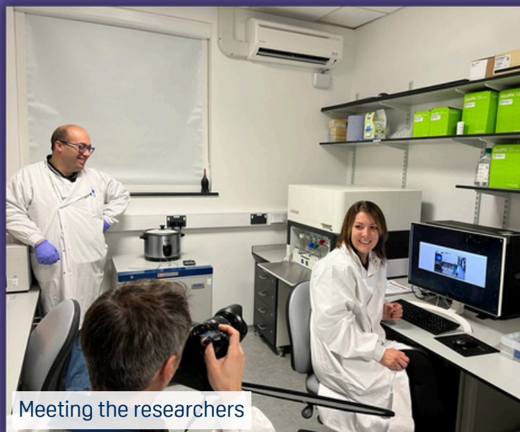
Meeting the researchers

By joining us, you can become part of something bigger: a mission to tackle the most pressing and overlooked health challenges of our time.